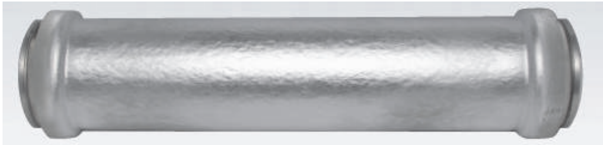
Fully Utilized Target Tube >80% Utilization