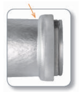
Minimal Turnaround Groove