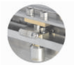
Micrometer Adjustment for Uniformity